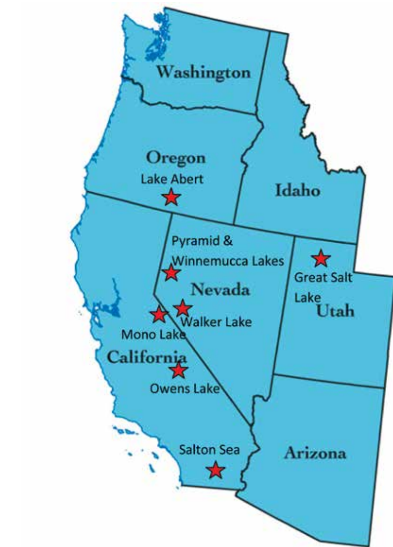
Figure 1. Terminal lakes in the western United States described in this issue.

There are successful templates, such as Pyramid and Mono lakes to serve as guides for how these lakes can be saved or restored. The key involves local effort to bring the problem to the attention of