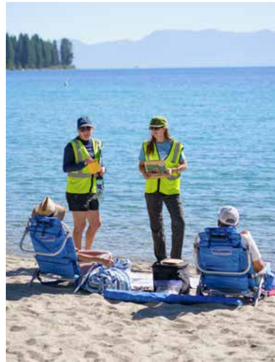
Figure 5. Eyes on the Lake Outreach Team volunteers educate recreators about the threat of invasive golden mussels in the summer of 2025. They also provide instructions for how to clean, drain and Dry water gear.

was built using ArcGIS’s Survey123 and includes six surveys where people can share observations of nearshore water quality, algae, litter, and graffiti, among other things (Figure 6).