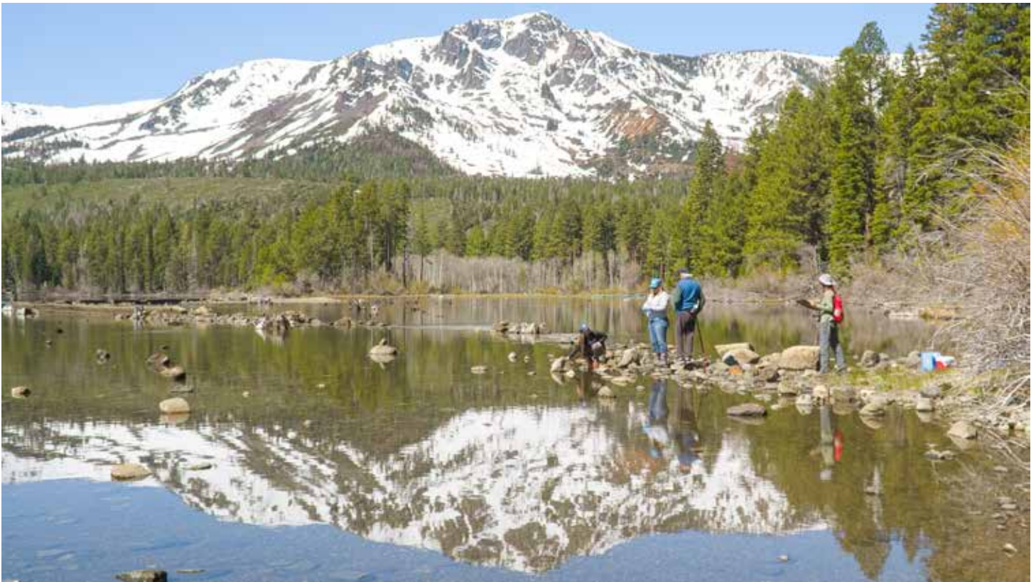
Figure 1. A Snapshot Day volunteer team collects water samples and makes visual observations on the northern shore of Fallen Leaf Lake, California, in May 2024.

significant changes in conductivity can signal new discharges entering the water.