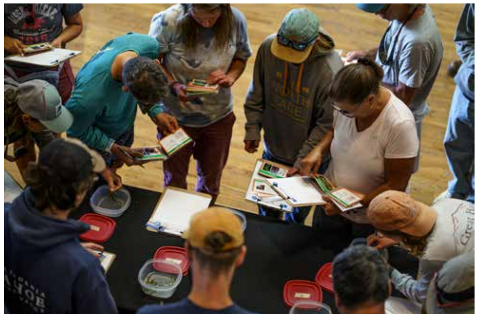
Figure 3. Volunteers practice aquatic plant identification using samples and printed ID guides as part of an Eyes on the Lake training in 2025.

Here is a typical example: A paddler sees what they think may be curlyleaf pondweed ( Potamogeton crispus ) growing near a marina. They submit a photo, GPS coordinates, and other information through the Citizen Science Tahoe web app. Within a few days, scuba divers are in the water to remove the few problem plants before they can proliferate (Figure 4).