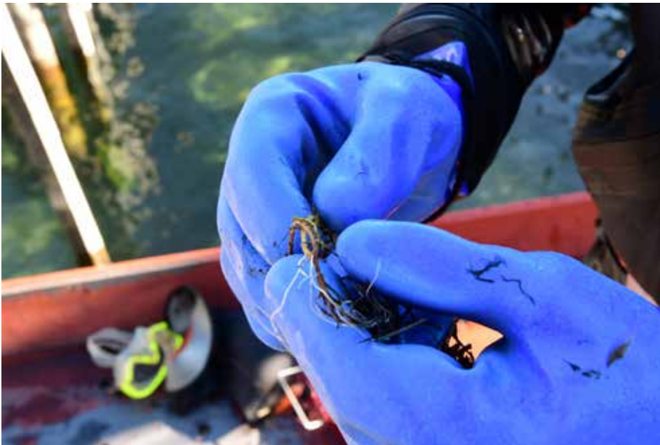
Figure 4. A diver examines an aquatic plant specimen removed from the lake floor below a Tahoe marina to determine whether it is curlyleaf pondweed. The action was part of a 2021 deployment of Tahoe’s Early Detection and Rapid Response Protocol to prevent aquatic invasive species from spreading.

The Eyes on the Lake program has trained 680 volunteers and generated 1,506 aquatic invasive species surveys. That volunteer effort has led to the identification and prevention of eight aquatic invasive species infestations in Lake Tahoe – eight instances where the lake’s water quality was protected because citizen scientists were empowered and active.