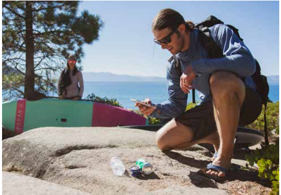
Figure 7. Before picking up litter near the shoreline, a paddler reports it using the Citizen Science Tahoe web app. Observations like this help identify and address litter hotspots.