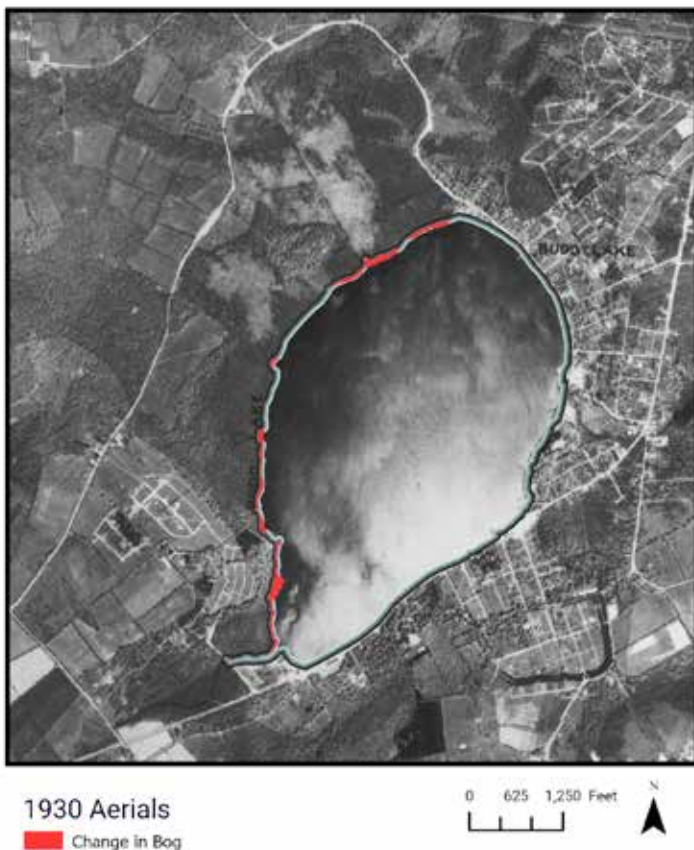
Figure 3. 1930 map of Budd Lake depicting changes in area of the bog.