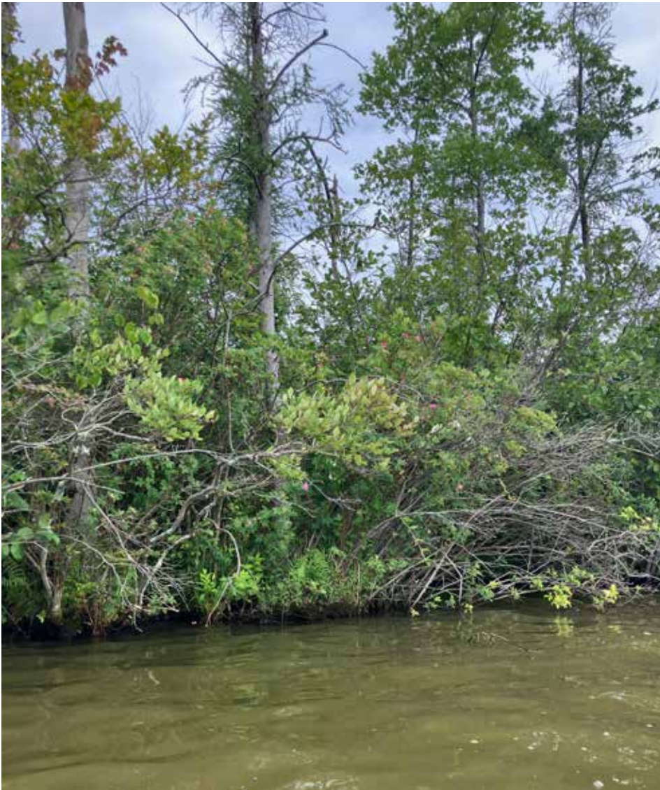
Figure 1. The bog at Budd Lake.

mass accumulation (Rocheft 2000). These ecosystems are important seed bank sources, particularly when there is significant disruption (Rocheft 2000). Due to the long term accumulating process of peat creation, the systems provide factual archives for historical environmental conditions (Rocheft 2000). Wetlands are known as nature's nursery, providing cover for many young species and contributing to their value towards biodiversity hotspots (Rocheft 2000). Excessive nutrient supply from runoff and atmospheric deposition have been called major threats to wetland ecosystems (Berger et al. 2017).