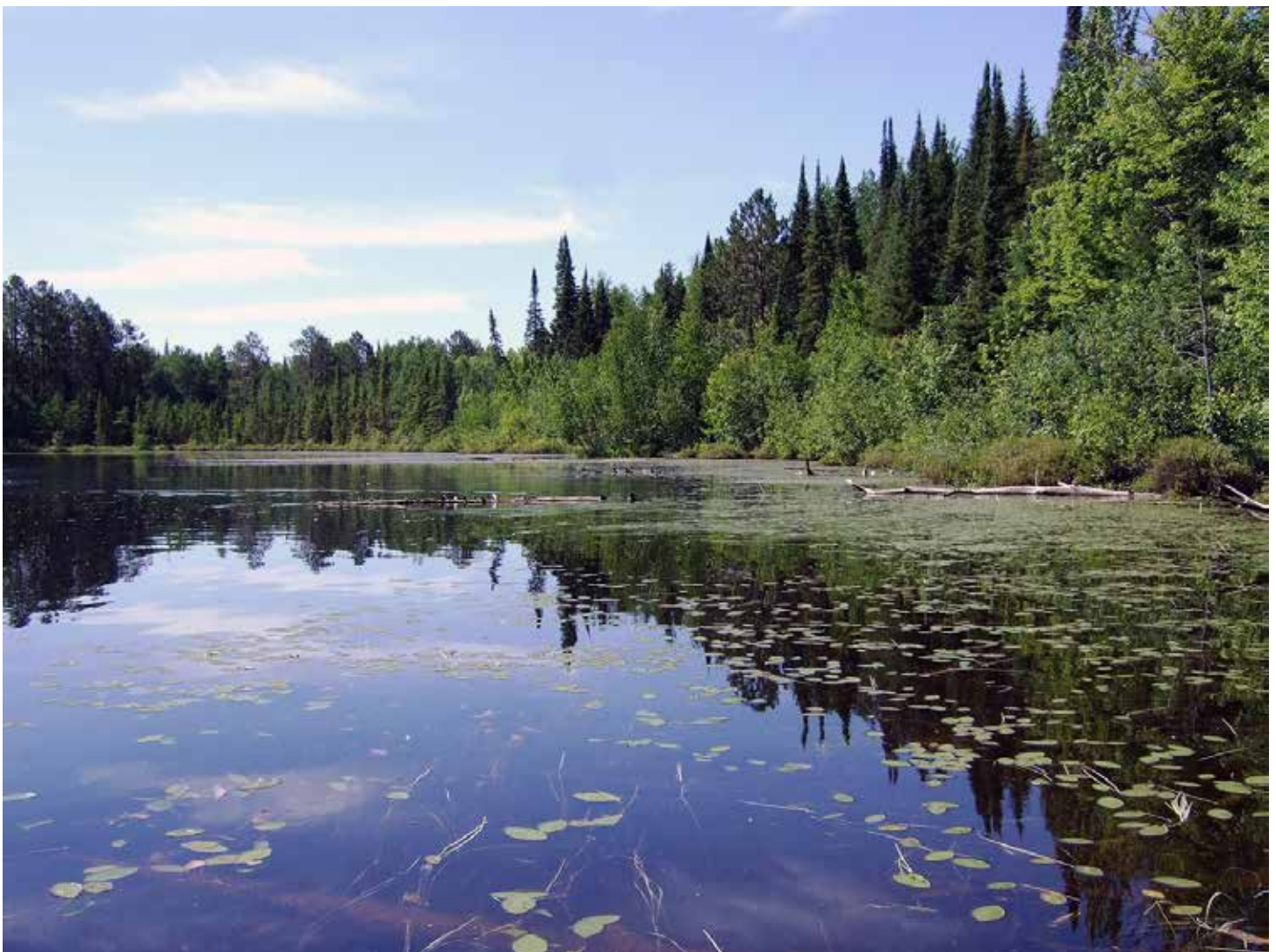
Figure 1. Protecting high quality waters in undisturbed watersheds (Lac Lake).

built a comprehensive database of physical, chemical, and biological data which we have used to inform the development of new approved water quality criteria (lake-specific numeric nutrient criteria, a specific conductance aquatic life use criterion, biological thresholds for streams).