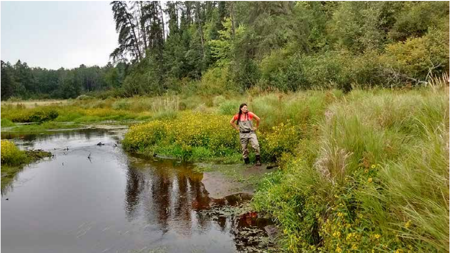
Figure 2. Monitoring in the headwaters of Otter Creek.