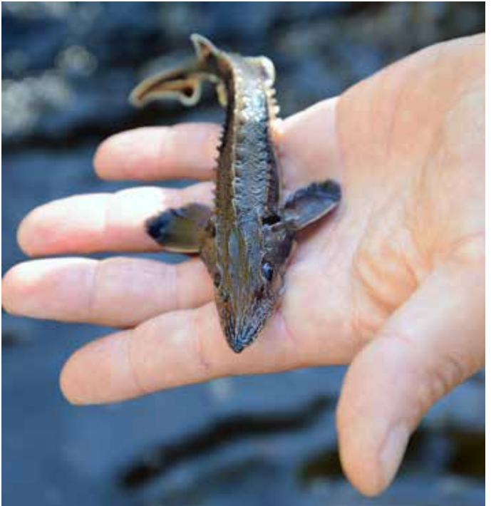
Figure 4. Restoring lake sturgeon to the upper St. Louis River.