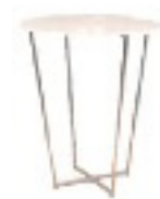
Gloss Display Table